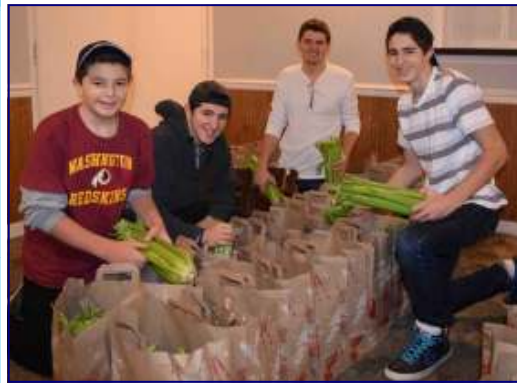
The Squires help fill bags with food for needy families. In addition to the food items provided by the council, the Maryknights donated grocery store gift cards to go in each bag.

You do not need to join or be a member to attend this meeting!